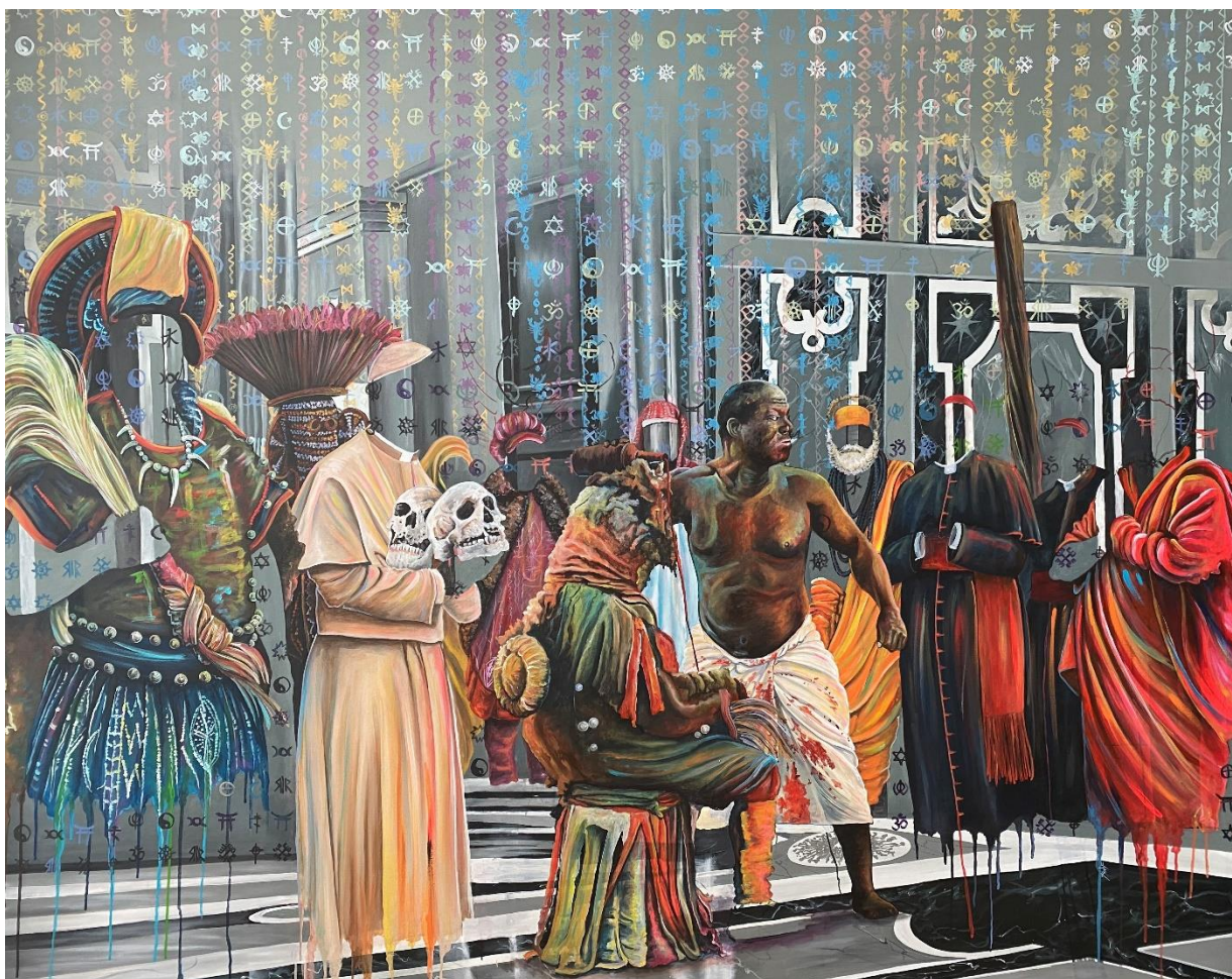
CULT – Sacred Rite (2023)

Acrylic on Canvas - 160 x 200 cm – EUR 11'000