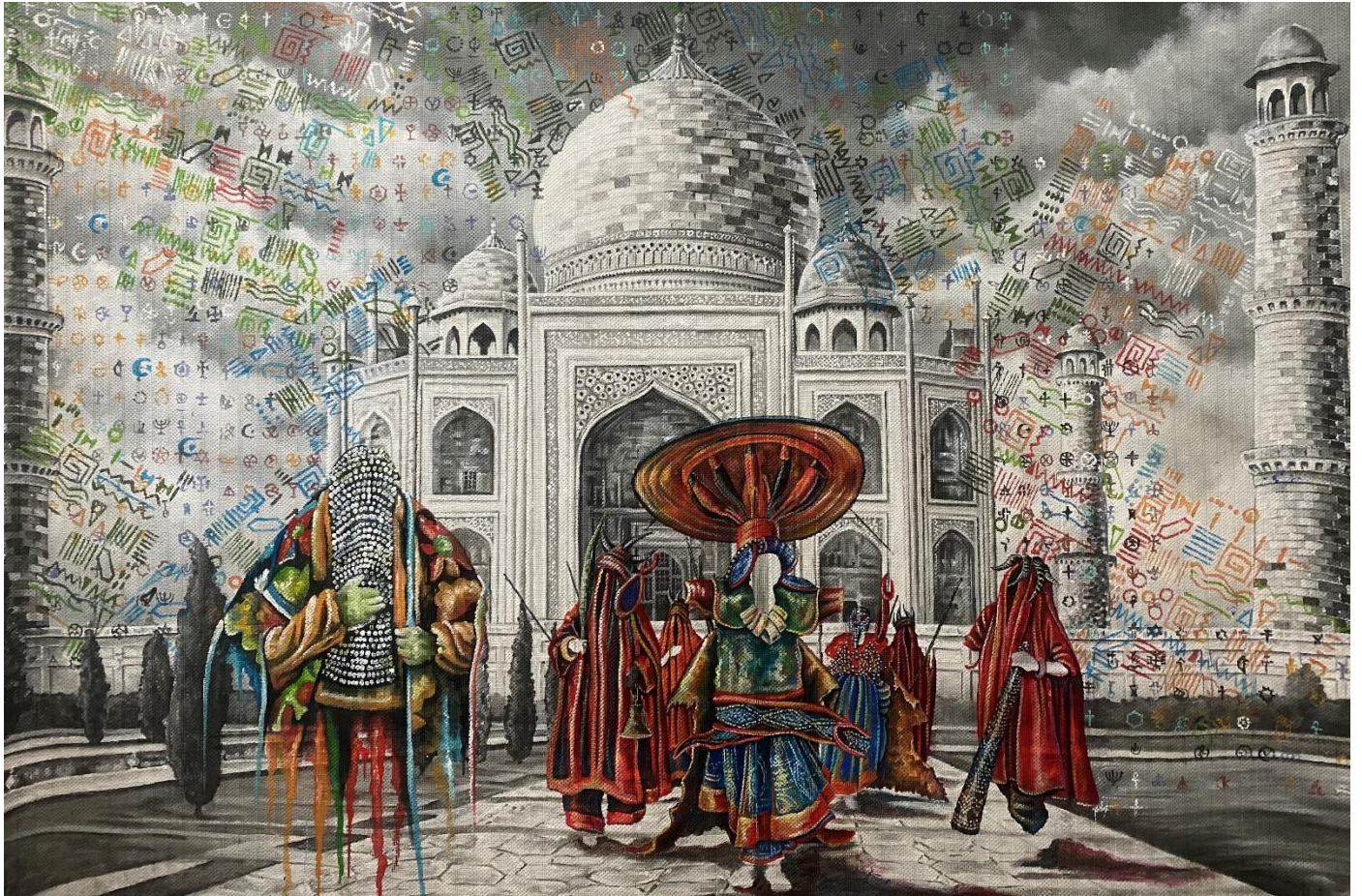
CULT – Sacred Exit (2022)

Acrylic on Carpet - 160 x 230 cm – EUR 11'000