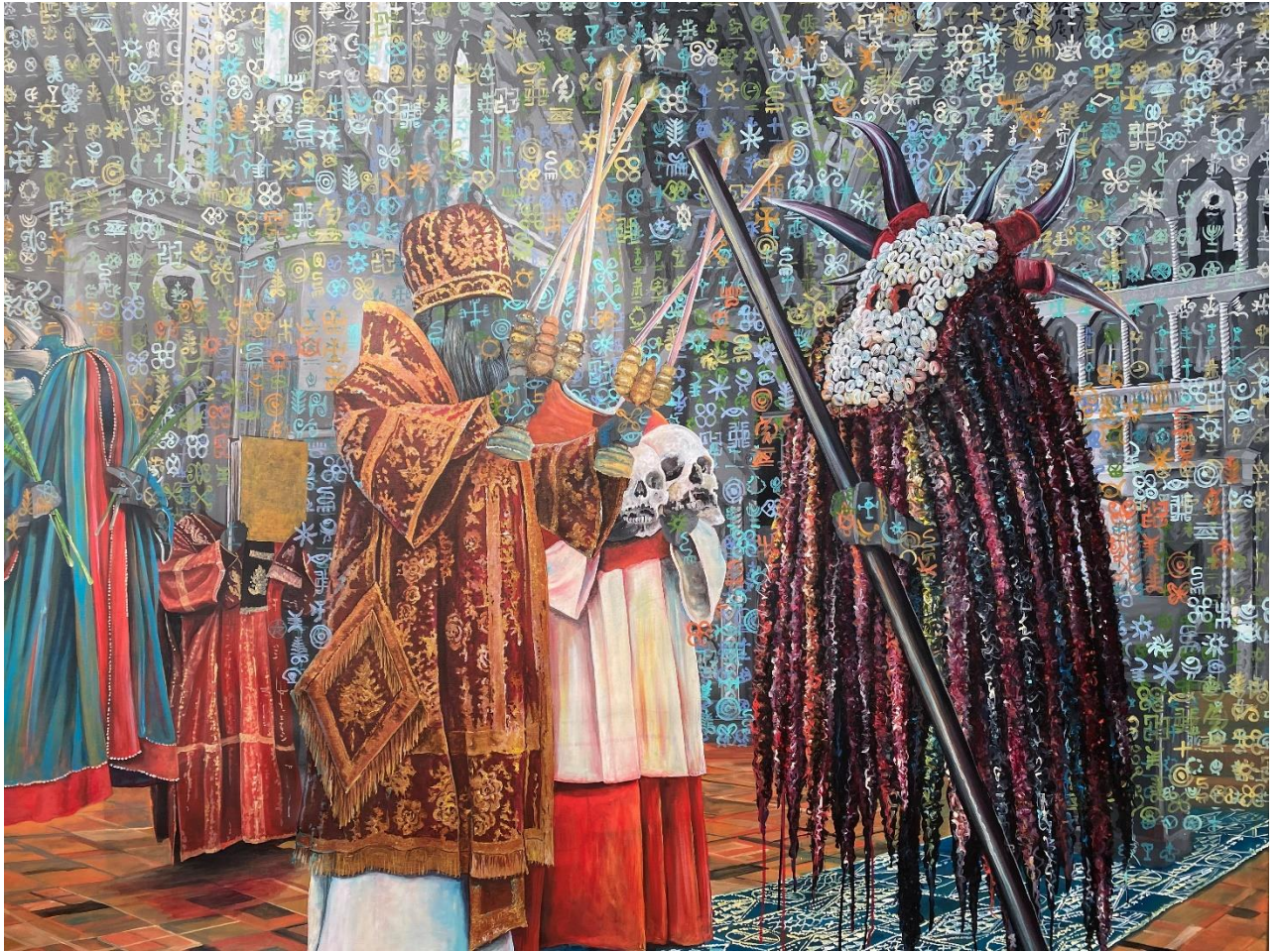
CULT – Holy Fire (2023)

Acrylic on Canvas - 160 x 200 cm – EUR 10'000