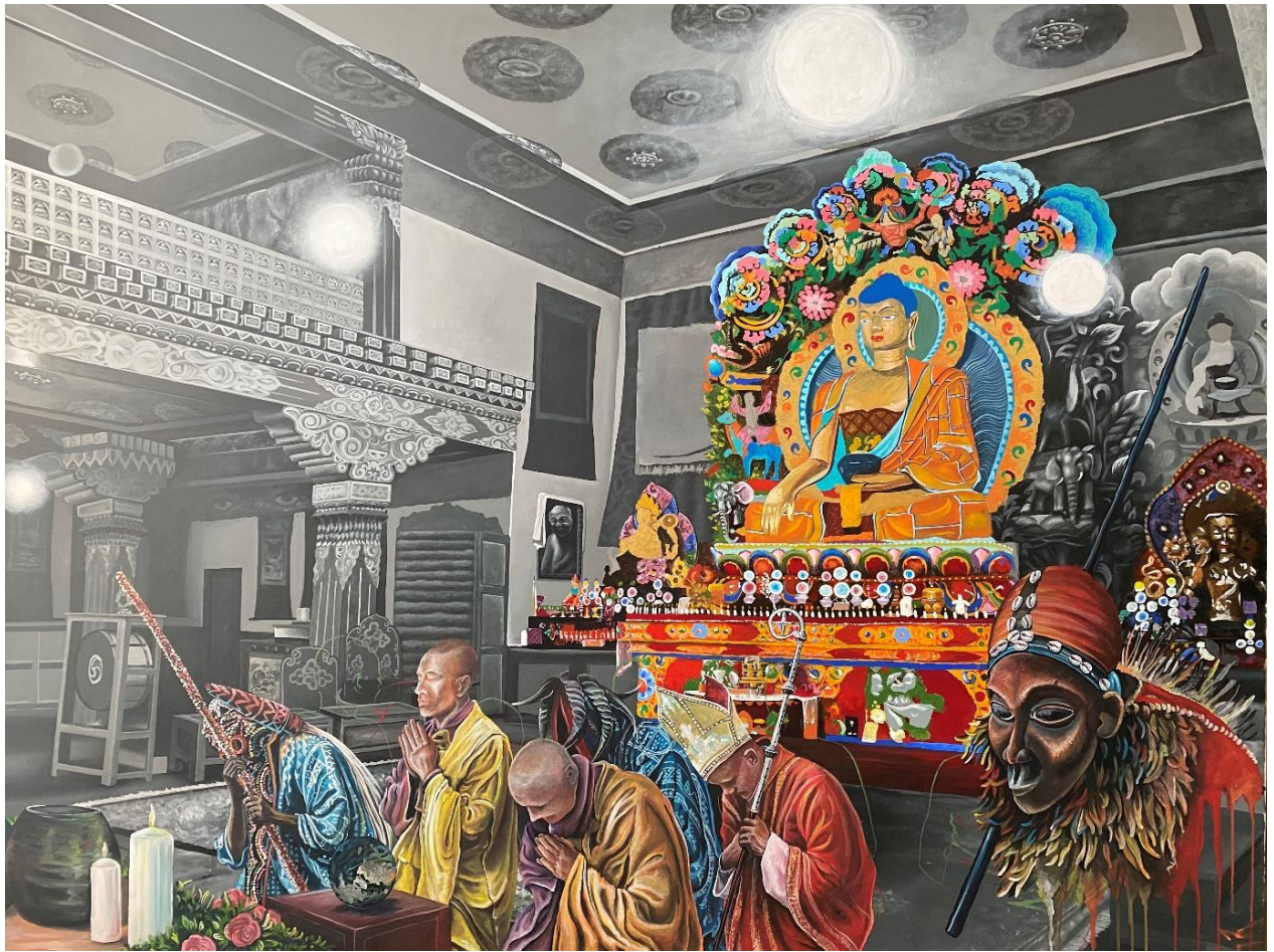
CULT – Adoration (2023)

Acrylic on Canvas - 160 x 200 cm – EUR 10'500