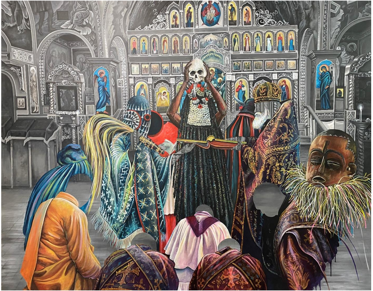
CULT - Ordination (2023)

Acrylic on Canvas - 160 x 200 cm – EUR 11'000