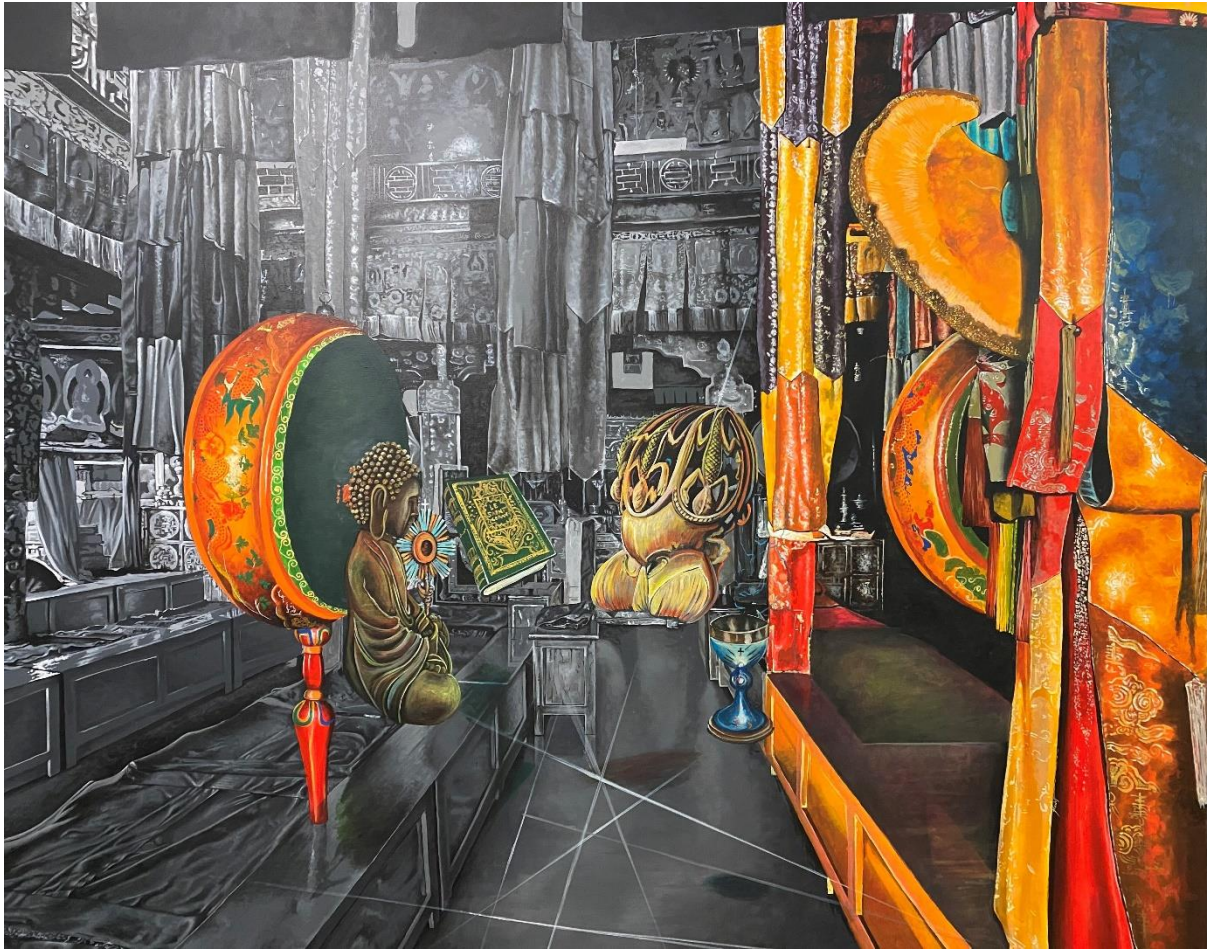
CULT – The Sacred (2023)

Acrylic on Canvas - 160 x 200 cm – EUR 10'500